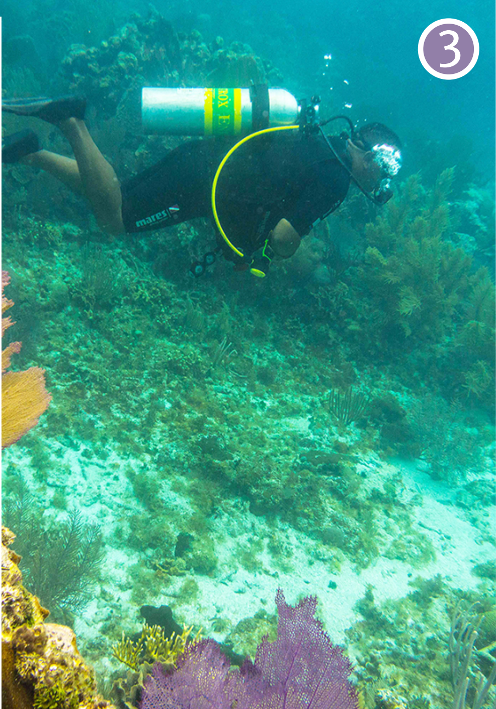
Tourism in Guanaja, Honduras.

Two other projects focus on the characterization and protection of a reef discovered five years ago in a surprisingly healthy condition.