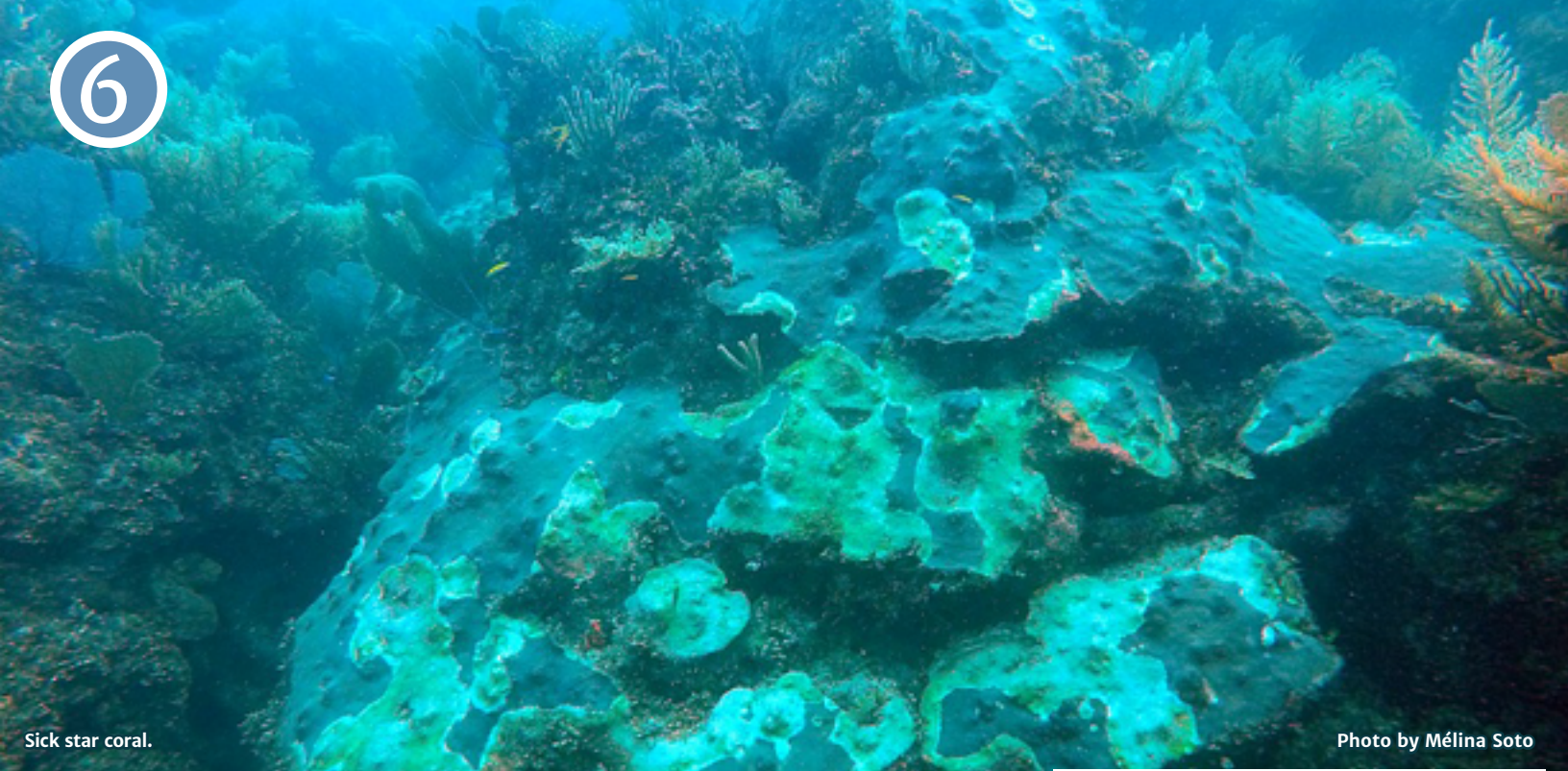
Sick star coral.