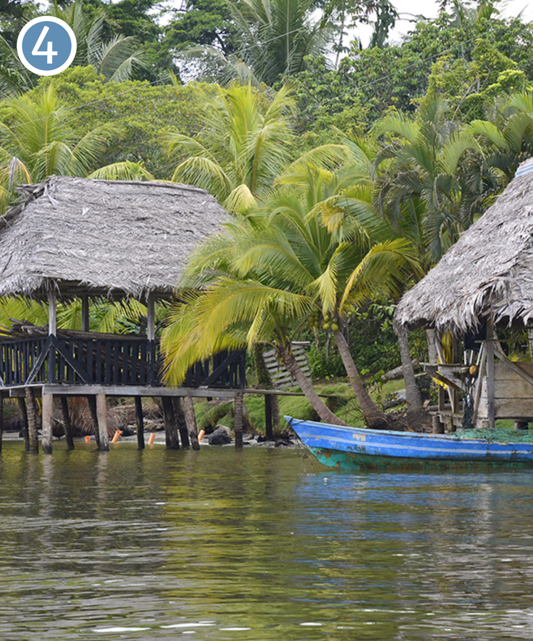
Barra Cocolí in Livingston, Izabal, Guatemala.