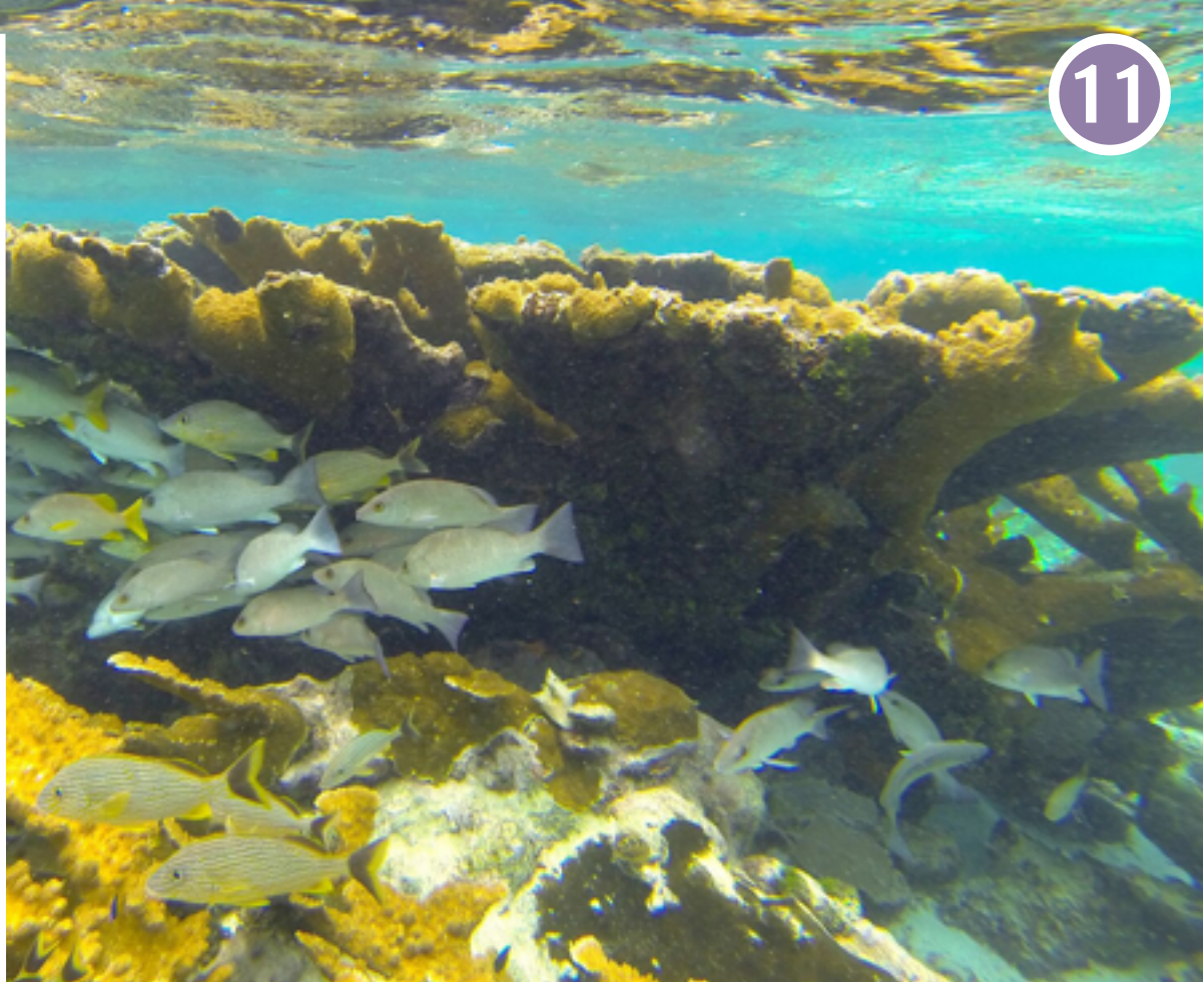
Coral reefs in Guatemala.