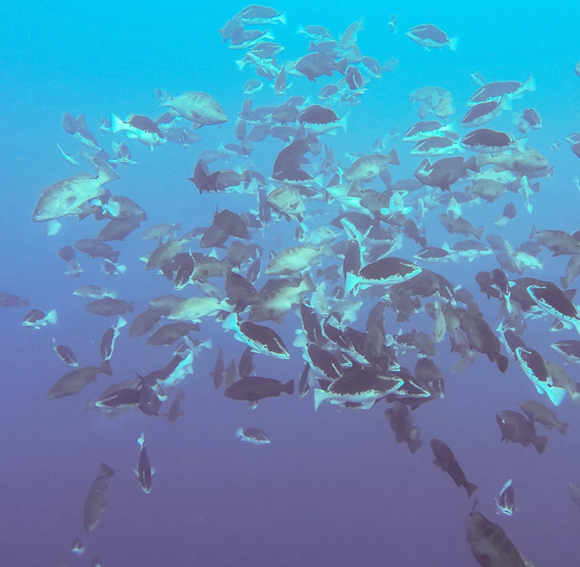
Fish aggregation in Belize.