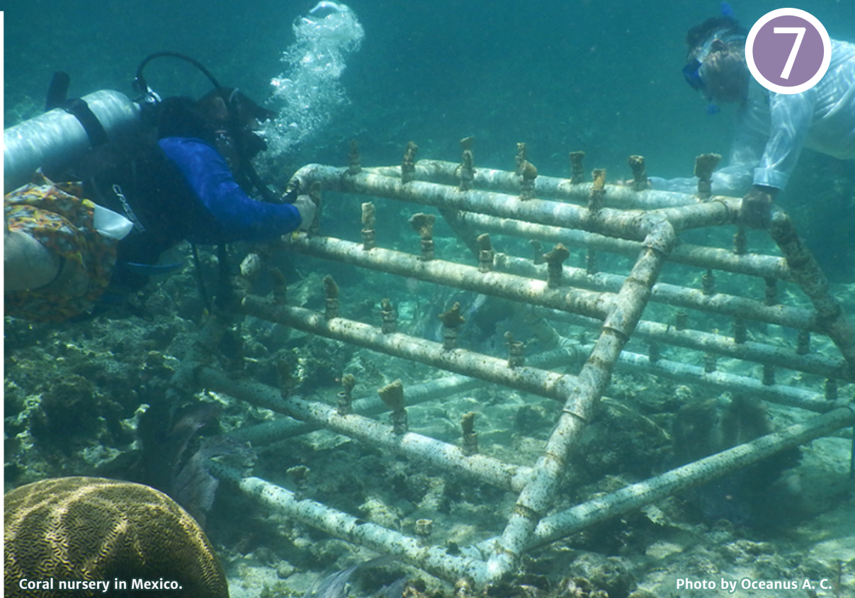
Coral nursery in Mexico.