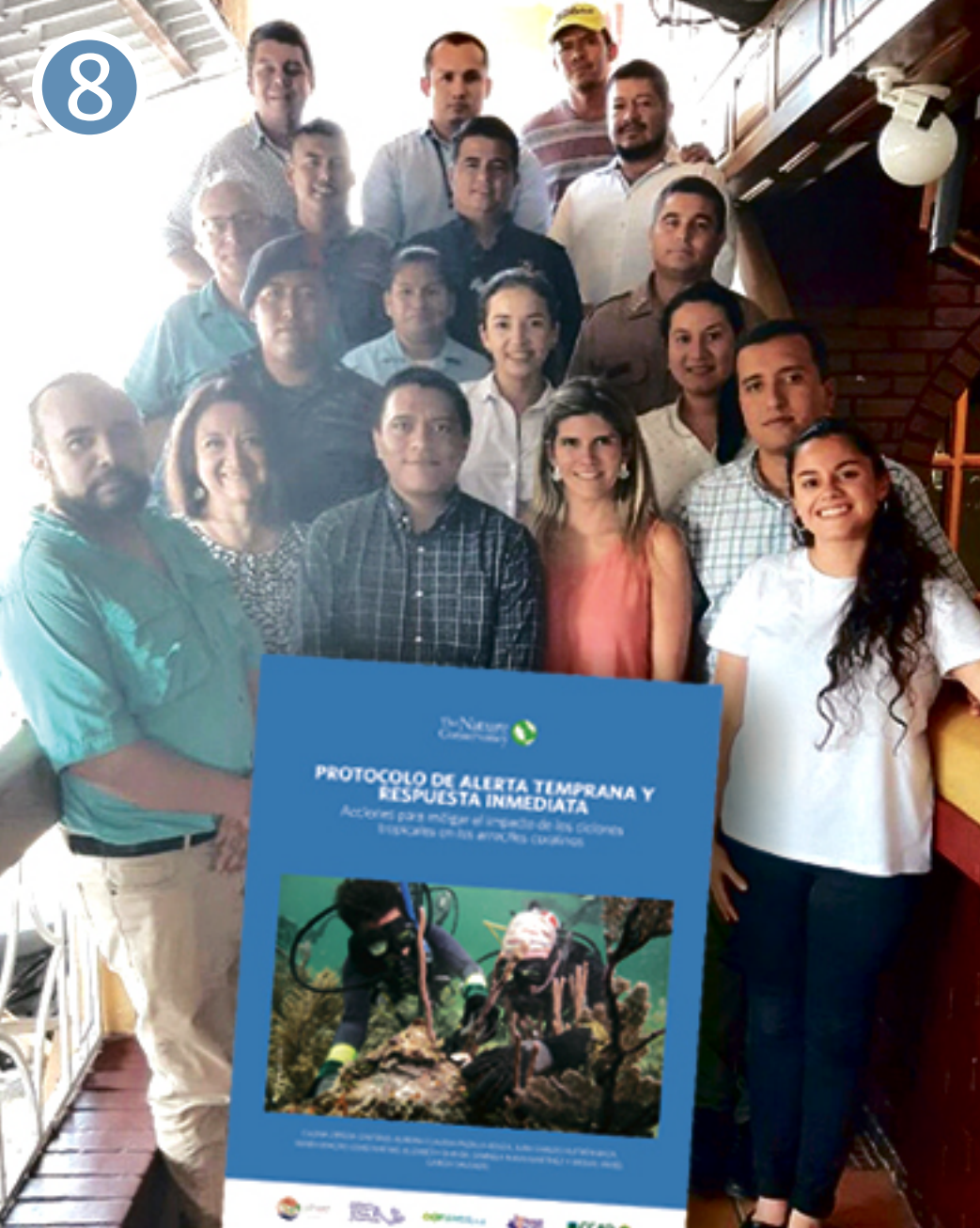
Participants in the training event to respond to damages caused by hurricanes, in the department of Izabal, Guatemala. Cover of the Early Warning and Rapid Response Protocol to be replicated in the MAR region.