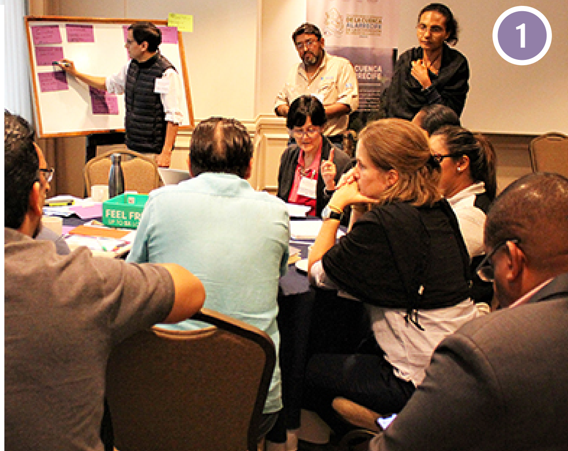
The workshop involved group activities on the mangrove ecosystem.

The event’s minutes, as well as other relevant products, can be downloaded from this link: http://bit.ly/37k2W1W