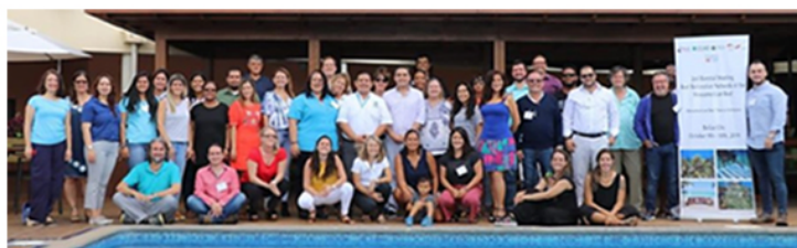
Attendants of the Second Biennial Meeting of the MAR Restoration Recovery.