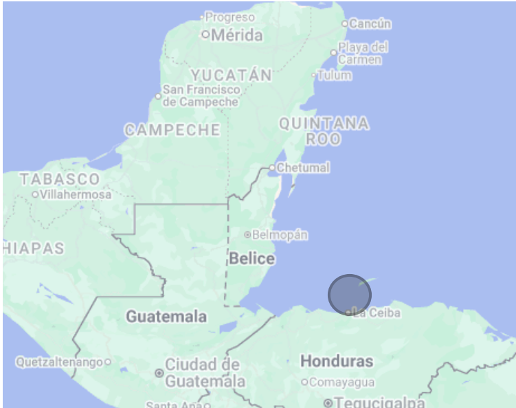
Location of Barras de Cuero y Salado Wildlife Refuge

The Phase III project represents a joint effort to strengthen the effective management of coastal and marine protected areas of the Mesoamerican Reef System. With financial contribution from the German Cooperation through the KfW, and the active participation of managers and co-managers of the CMPAs, this regional initiative enhances the protection of strategic ecosystems and contributes to sustaining the benefits they provide to local communities.