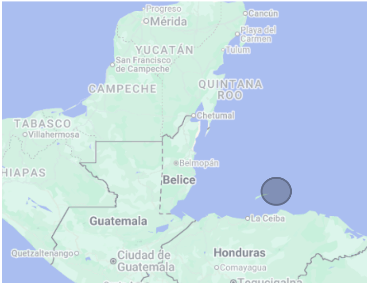
Michael Rock Special Marine Protection Zone

The Phase III project represents a joint effort to strengthen the effective management of coastal and marine protected areas of the Mesoamerican Reef System. With financial contribution from the German Cooperation through the KfW, and the active participation of managers and co-managers of the CMPAs, this regional initiative enhances the protection of strategic ecosystems and contributes to sustaining the benefits they provide to local communities.