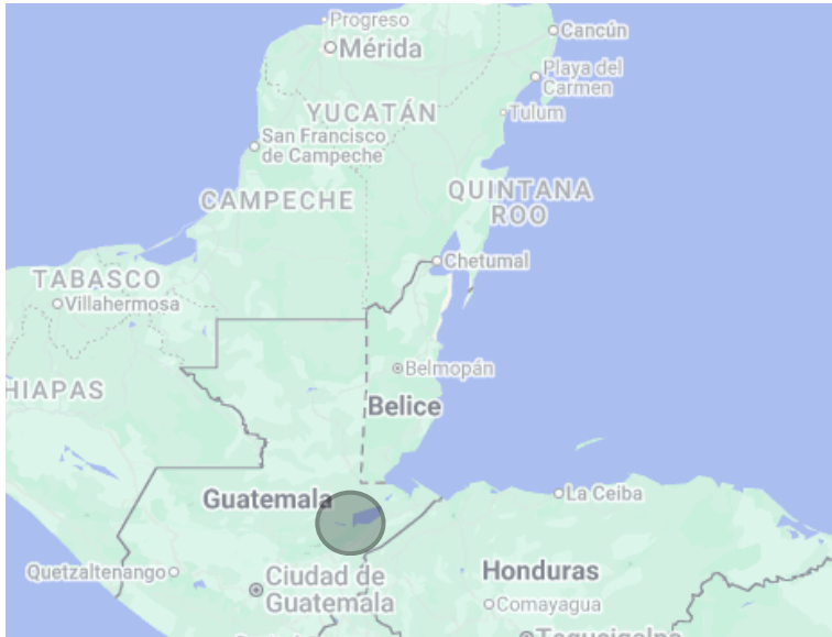
Location of the Bocas del Polochic Wildlife Refuge, Izabal.

The Phase III project represents a joint effort to strengthen the effective management of coastal and marine protected areas of the Mesoamerican Reef System. With financial contribution from the German Cooperation through the KfW, and the active participation of managers and co-managers of the CMPAs, this regional initiative enhances the protection of strategic ecosystems and contributes to sustaining the benefits they provide to local communities.