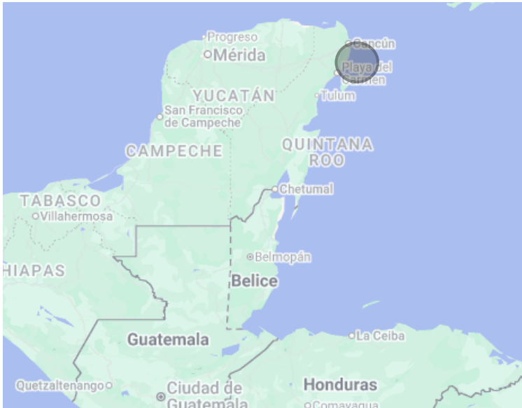
Location of the National Park Arrecifes de Puerto Morelos

The Phase III project represents a joint effort to strengthen the effective management of coastal and marine protected areas of the Mesoamerican Reef System. With financial contribution from the German Cooperation through the KfW, and the active participation of managers and co-managers of the CMPAs, this regional initiative enhances the protection of strategic ecosystems and contributes to sustaining the benefits they provide to local communities.