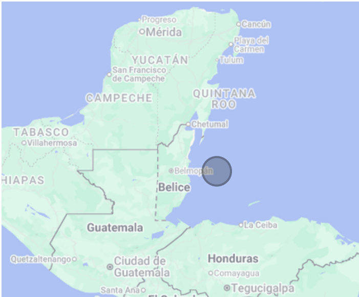
Location of Turneffe Atoll Marine Reserve

The Phase III project represents a joint effort to strengthen the effective management of coastal and marine protected areas of the Mesoamerican Reef System. With financial contribution from the German Cooperation through the KfW, and the active participation of managers and co-managers of the CMPAs, this regional initiative enhances the protection of strategic ecosystems and contributes to sustaining the benefits they provide to local communities.