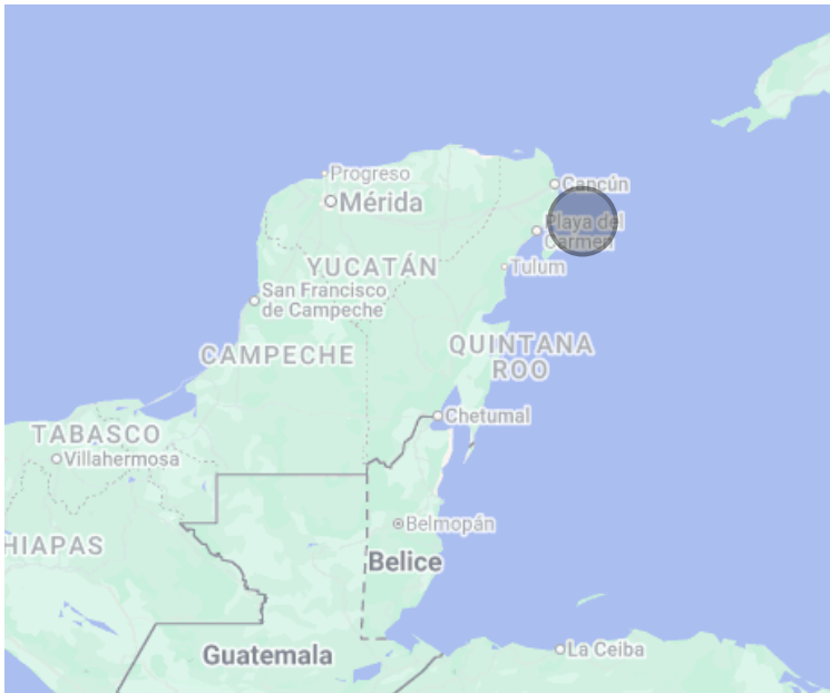
Location of the National Park Arrecife de Puerto Morelos