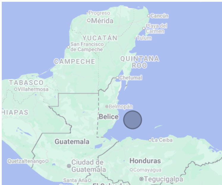
Location of Gladden Spit & Silk Cayes Marine Reserve