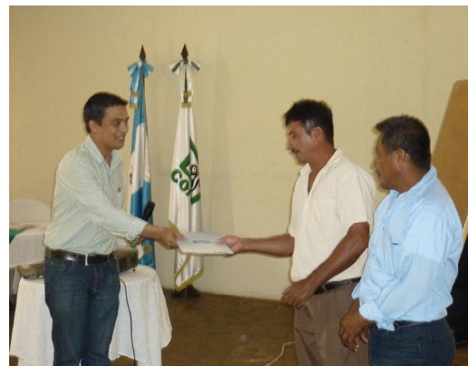
Authorities and fishers during the official signing ceremony