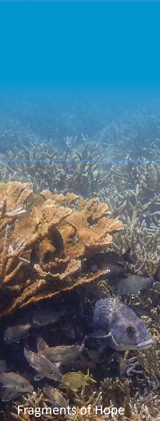
Fragments of Hope