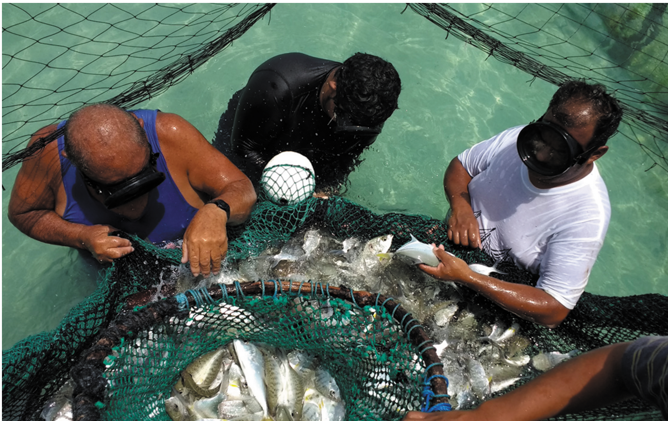
Three Generations, One GOAL. Sustainable Livelihood Bacalar Chico Marine Reserve, Belize