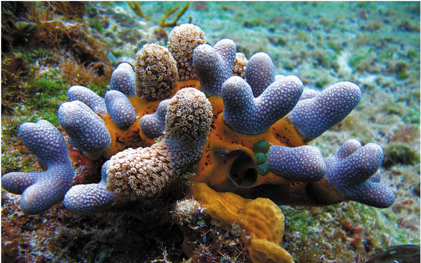
Porites polyps Cozumel, Quintana Roo, Mexico